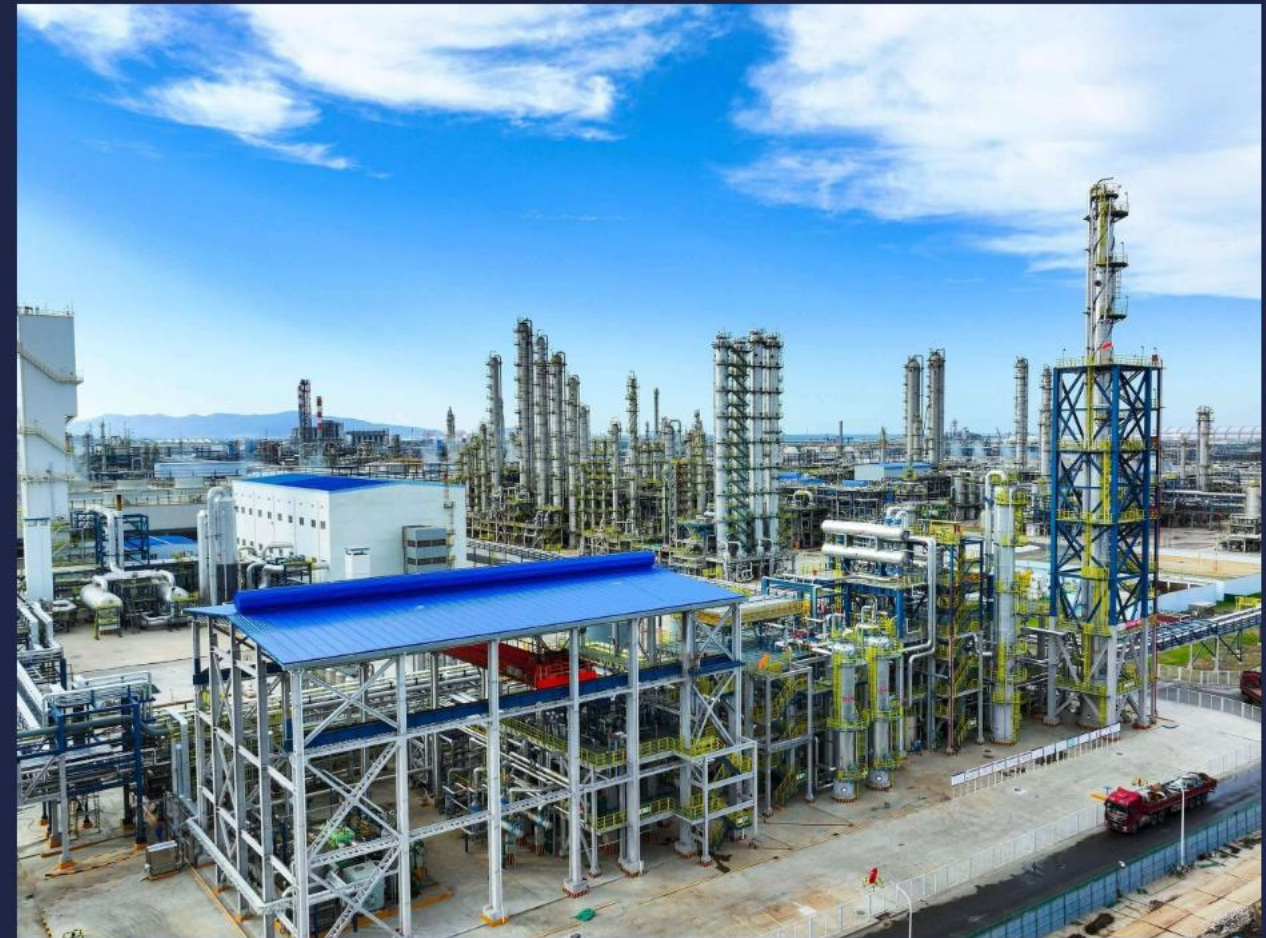
Aerial overview photograph of the CO 2 to Methanol plant operating with CR's ETL technology™ - located at the Shenghong Petrochemical Industrial Park in Jiangsu, China.

The plant has the capacity to produce 100,000 tonnes of sustainable methanol annually – the second-largest CO 2 -to-methanol plant in the world. Used primarily to supply their olefins facility, this methanol will be used to produce chemical derivatives, including sustainable plastics and EVA coatings for solar panels. This will reduce the reliance on fossil-based methanol to drive more sustainable value chains and carbon footprint reduction initiatives across various sectors, such as industrial manufacturing and renewable energy.