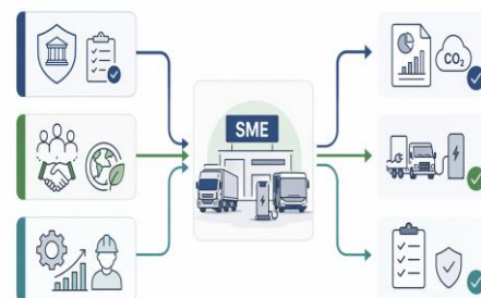
Conceptual view of internal capabilities shaping SME decarbonization readiness.

DtG examines how external pressures, regulation, customer demands, financing expectations, and market signals interact with the internal realities of transport and logistics SMEs. Through literature review, interviews, and ecosystem analysis, it identifies the practical capabilities these firms need to move from reactive compliance to credible decarbonization action.